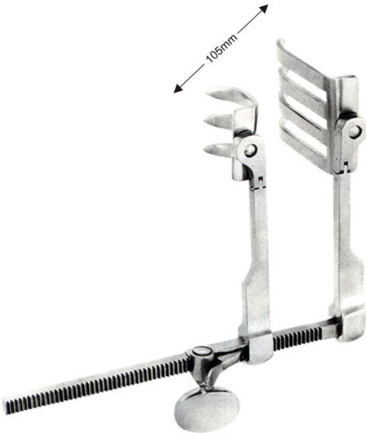
CASPAR PI - 28.740.00 compl. PI - 28.740.15 ohne Valven • without blades • sans valves • sin valvas • senza valve