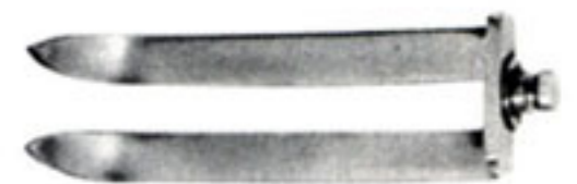
mm CASPAR 35x22 PI - 28.732.35 40x22 PI - 28.732.40 45x22 PI - 28.732.45 50x22 PI - 28.732.50 55x22 PI - 28.732.55 60x22 PI - 28.732.60 65x22 PI - 28.732.65 70x22 PI - 28.732.70