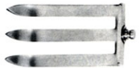
mm CASPAR 35x37 PI - 28.733.35 40x37 PI - 28.733.40 45x37 PI - 28.733.45 50x37 PI - 28.733.50 55x37 PI - 28.733.55 60x37 PI - 28.733.60 65x37 PI - 28.733.65 70x37 PI - 28.733.70