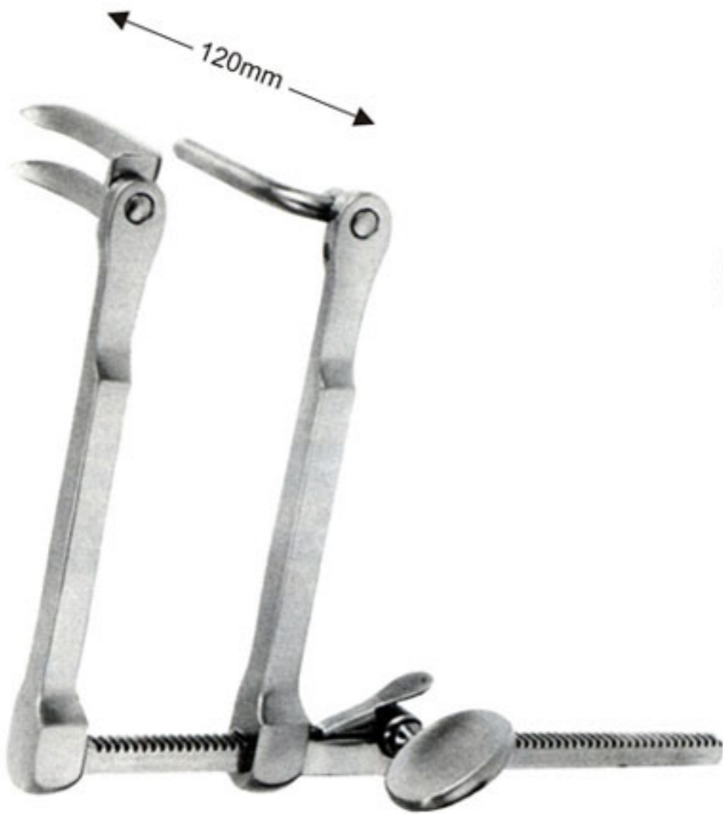
mm CASPAR 50 PI - 28.731.50