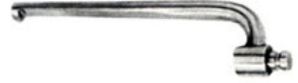
mm CASPAR 70 PI - 28.731.70