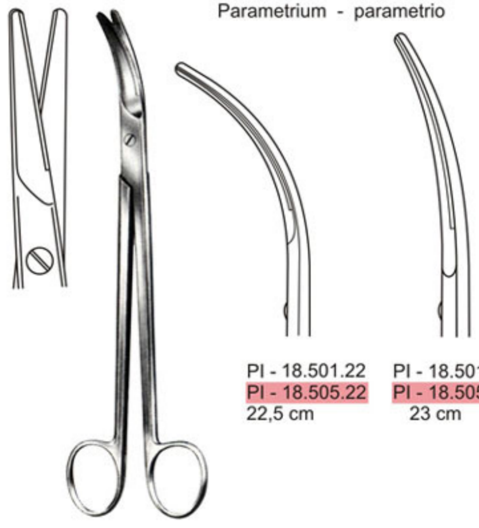
PI - 18.501.22 PI - 18.505.22 22,5 cm PI - 18.501.23 PI - 18.505.23 23 cm