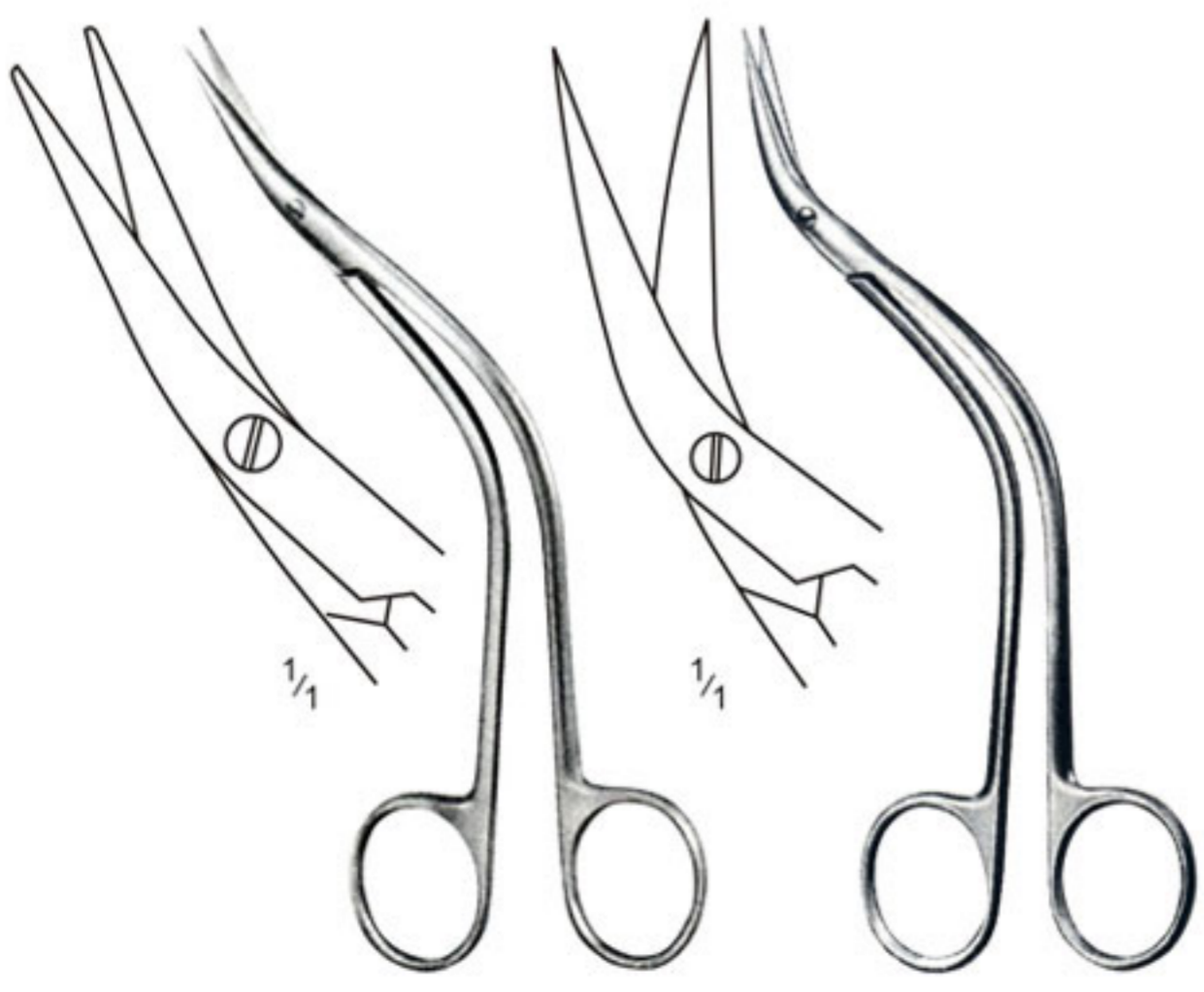
DE BAKEY PI - 18.495.15 15,5 cm