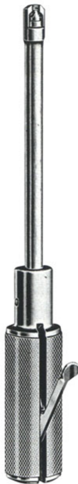
WILLIAMS PI - 43.624.24 24 cm