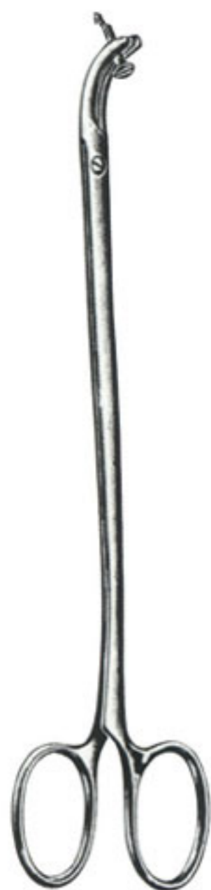
LANE PI - 43.635.18 18 cm