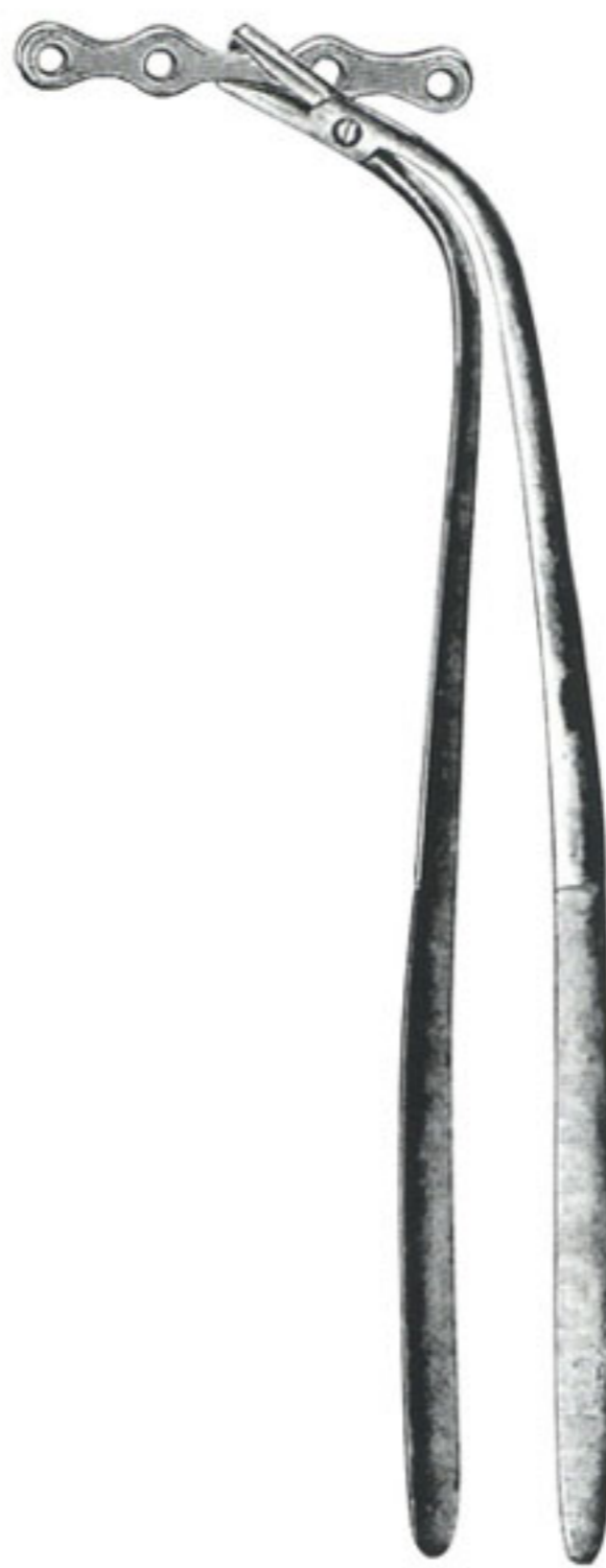
LANE PI - 43.639.22 22 cm