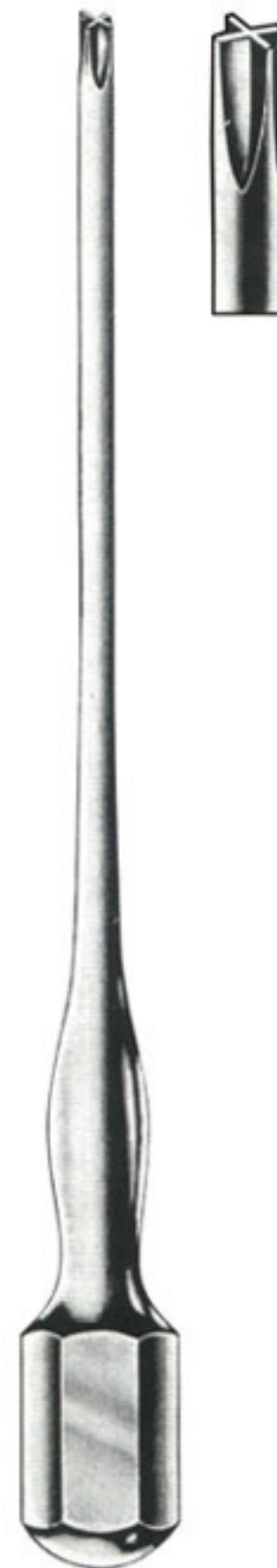
LANE PI - 43.632.25 25 cm