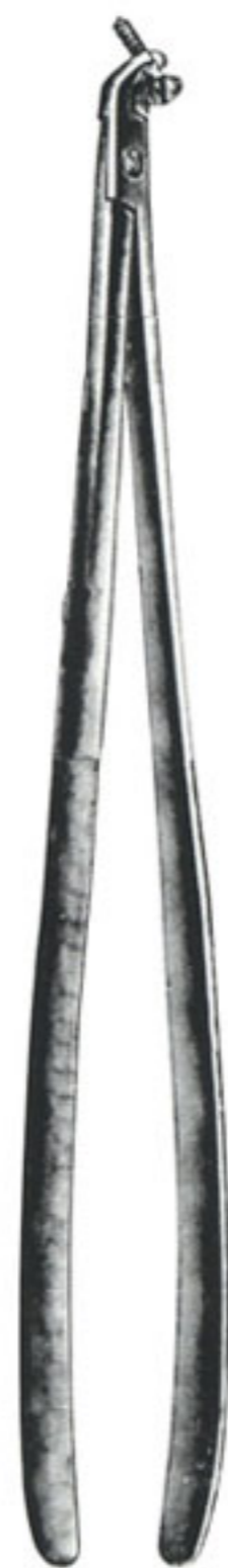
LANE PI - 43.637.23 23 cm