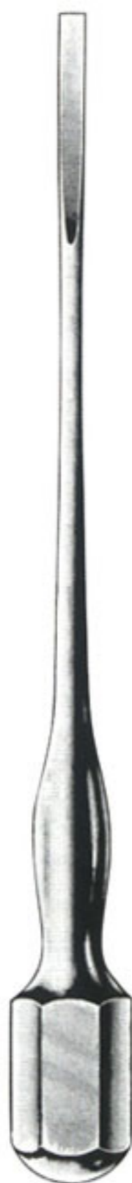
LANE PI - 43.602.25 25 cm