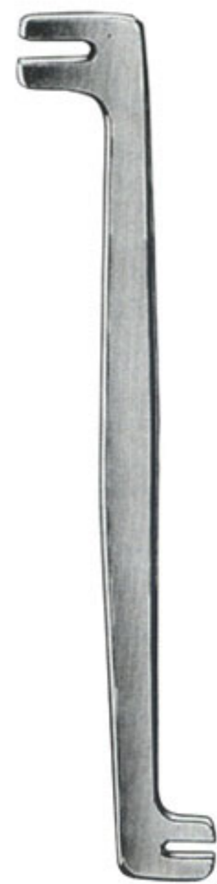
LANE PI - 43.640.18 18 cm