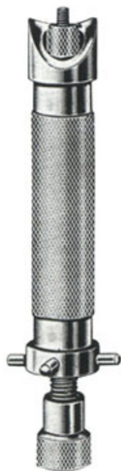
LLOYD PI - 43.602.20 20 cm