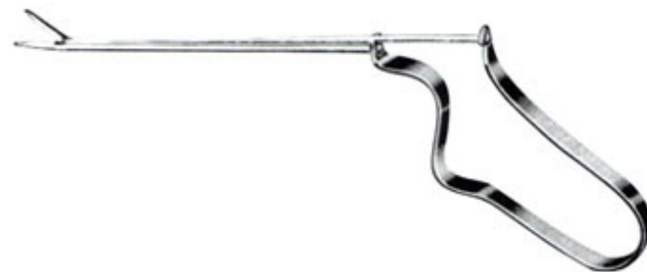
BUCK PI - 54.253.11 11 cm