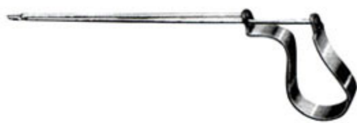
QUIRE PI - 54.251.10 10 cm