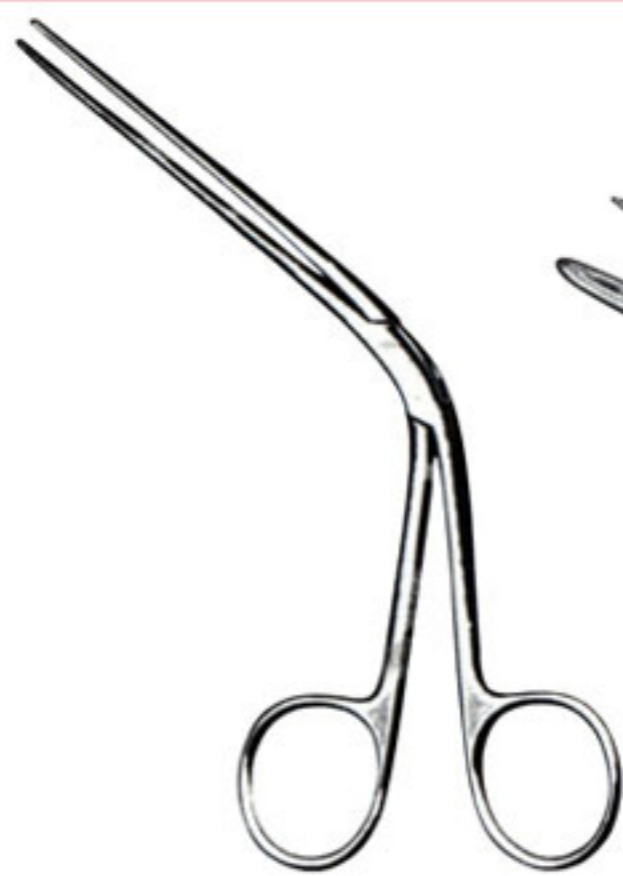
TILLEY PI - 54.243.14 14cm