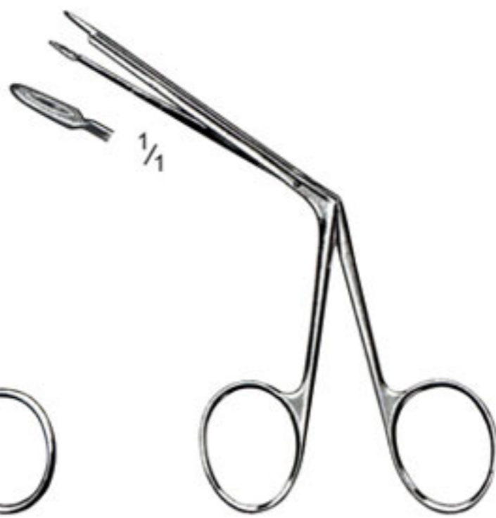
LITTAUER PI - 54.245.12 12 cm