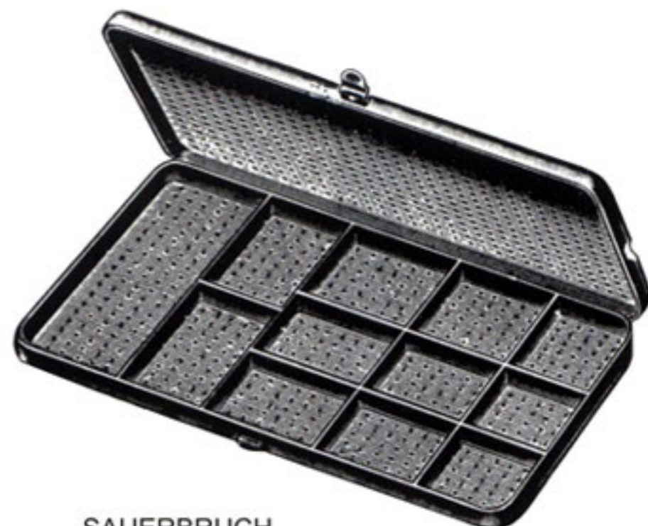
SAUERBRUCH PI - 98.110.21 210x125x17 mm

18/10 Edelstahl rostfrei Stainless Steel Acier inoxydable Acero inoxidable Acciaio inossidabile