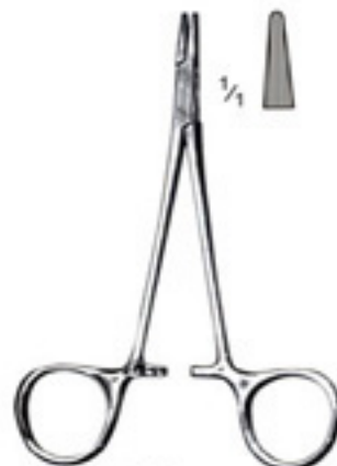
DERF PI - 34.120.12-S 12,5 cm