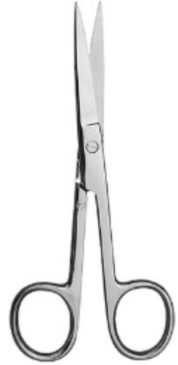
Operating Scissors PI-91-3103 Straight, Sharp / Sharp 13,14,15,17.5,20,