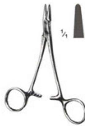
BAUMGARTNER PI - 34.150.12-S 12,5cm PI - 34.150.14-S 14,0cm