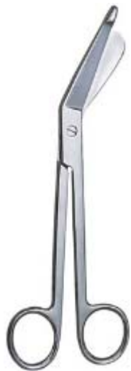
Lister PI-91-3110 14,18,