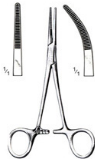
cm 14 KELLY PI - 22.240.14-S PI - 22.241.14-S