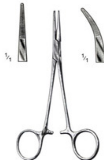
PROVIDENCE-HOSPITAL PI - 22.270.14-S PI - 22.271.14-S