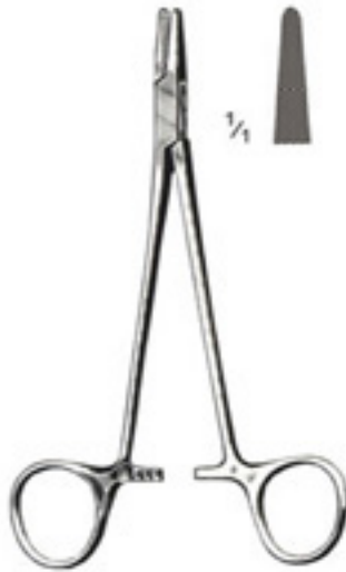
CRILE- MURRAY PI - 34.170.15-S 15cm