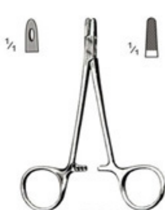
DERF PI - 34.110.12-S 12 cm