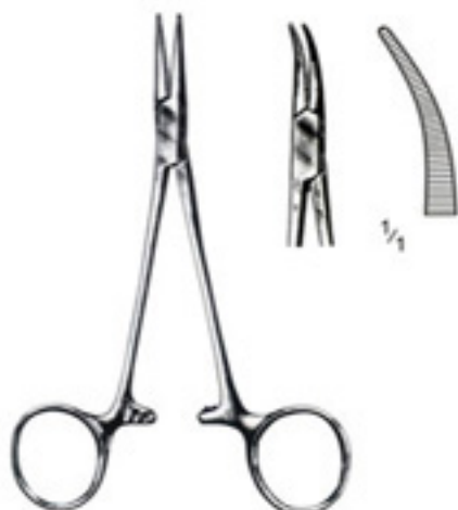
— HALSTED-MOSQUITO —