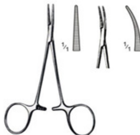
— HALSTED-MOSQUITO micro —