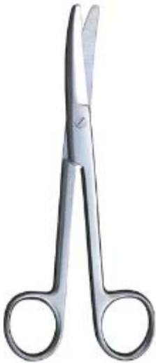
Mayo PI-91-3104 14,15,17,