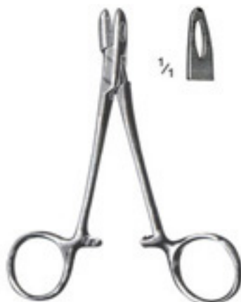
COLLIER PI - 34.122.12-S 12,5cm