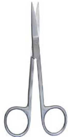
Iris PI-91-3109 10,13,15,