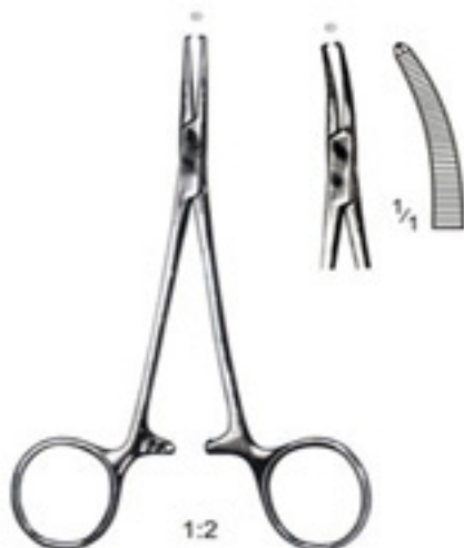
— HALSTED-MOSQUITO —