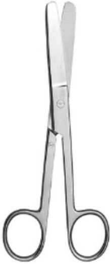
Operating Scissors PI-91-3101 Straight, Blunt / Blunt 13 ,14,15,17.5 ,20,