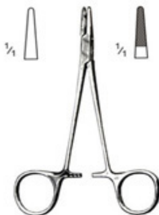
HALSEY PI - 34.130.13-S 13cm PI - 34.140.13-S 13cm