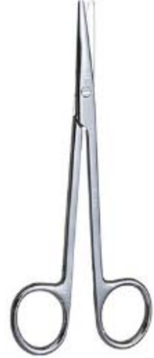
Metzenbaum PI-91-3106 14,23,