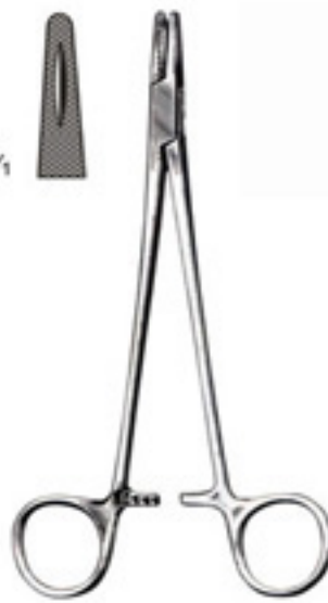
MAYO- HEGAR PI - 34.180.14-S 14 cm PI - 34.180.16-S 16 cm PI - 34.180.18-S 18 cm PI - 34.180.20-S 20 cm PI - 34.180.24-S 24 cm PI - 34.180.26-S 26 cm PI - 34.180.30-S 30 cm