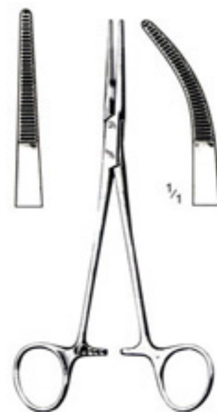
KELLY-RANKIN PI - 22.242.16-S PI - 22.243.16-S