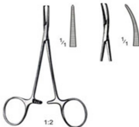
— HALSTED-MOSQUITO micro —