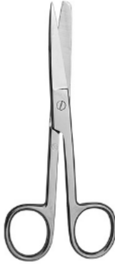
Operating Scissors PI-91-3102 Straight, Blunt / Blunt 13,14,15,17.5,20,