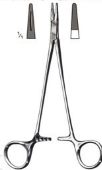
MAYO- HEGAR PI - 34.190.16-S 16cm PI - 34.190.18-S 18cm PI - 34.190.20-S 20cm