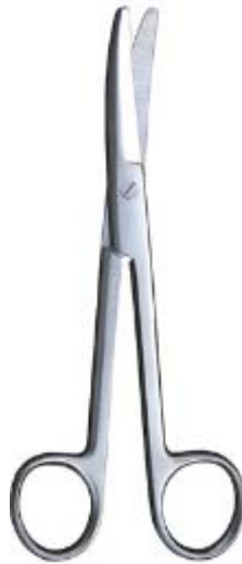
Mayo PI-91-3105 14,15,17,