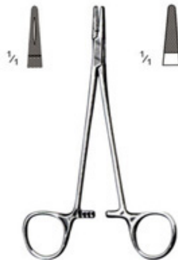
CRILE- WOOD PI - 34.160.15-S 15cm PI - 34.160.18-S 18cm PI - 34.160.20-S 20cm